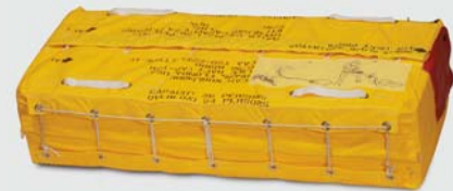
T36 - PACK Can be Customized to Fit Your Cabin Requirements