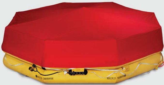
T36 LIFE RAFT Standard Canopy