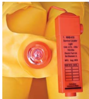
VEST LOCATOR LIGHT & WATER-ACTIVATED BATTERY