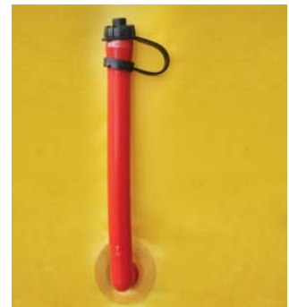
ORAL INFLATION TUBE WITH DUST COVER