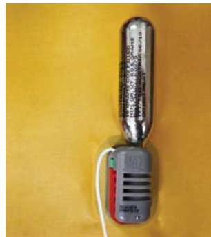
CO 2 INFLATION CYLINDER