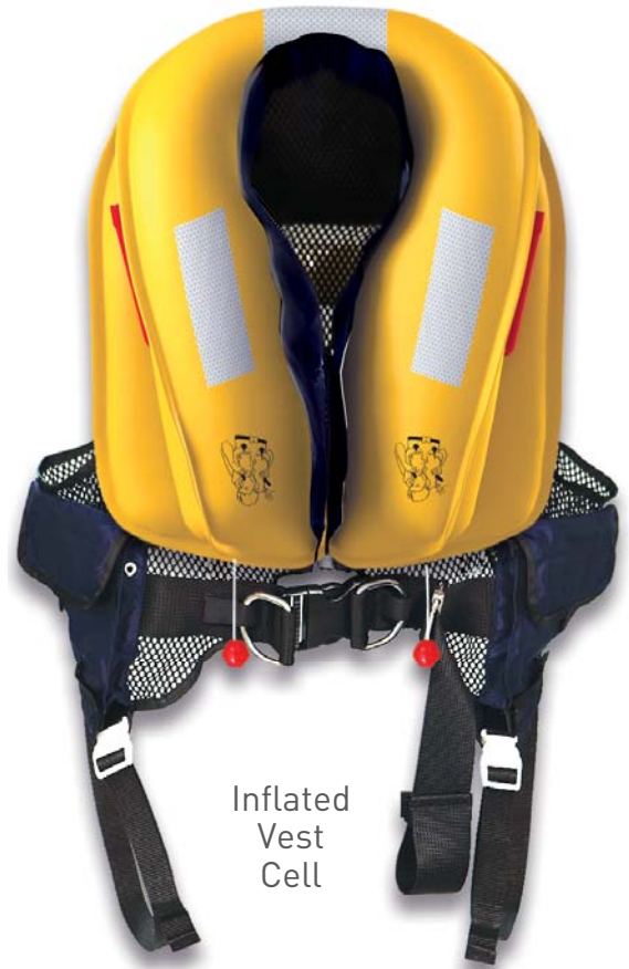
Inflated Vest Cell