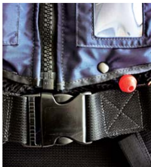
ADJUSTABLE 2" WAIST STRAP