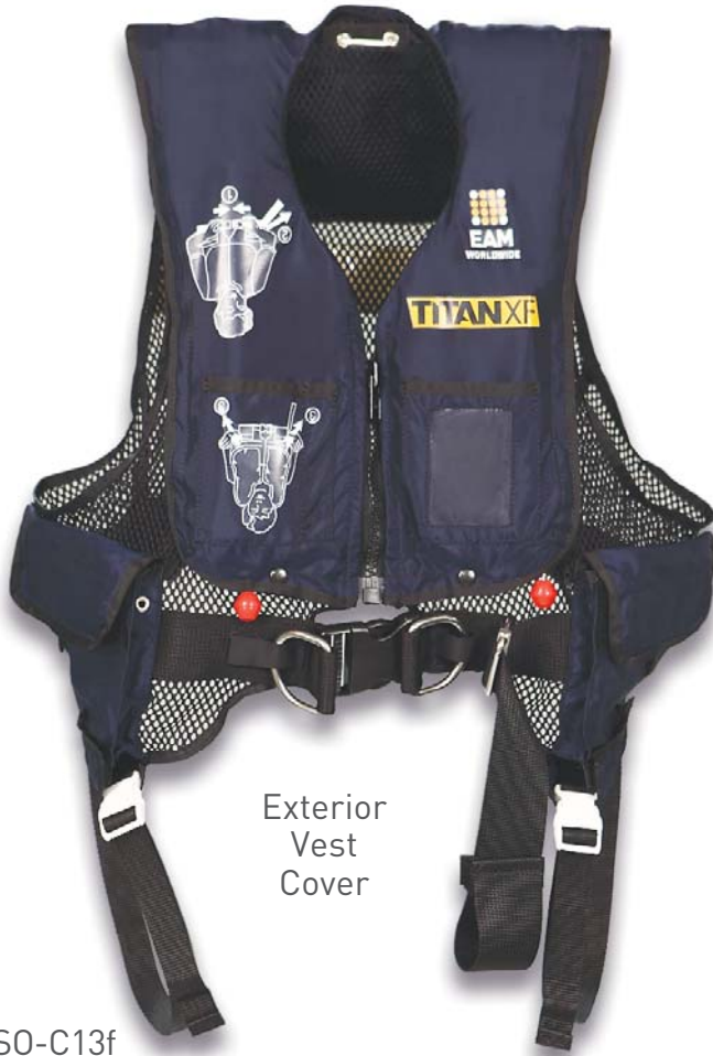
Exterior Vest Cover